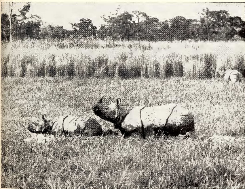
Above : A herd of Wild Buffalo in Kaziranga. The master bull is in the rear. Below : Mother and young rhino in Kaziranga. The baby is leading the way as usual.